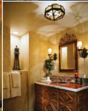
TOP: SFA Design went with a Spanish, slightly Moroccan design for the 1,900-square-foot, one-bedroom Hacienda Penthouse at Ojai Valley Inn & Spa, in keeping with architect Bill Mahan's initial vision. BOTTOM: SFA Design used floor-to-ceiling wood cladding in the guest rooms of the Chumash Casino Resort Hotel to visually make the space feel taller.